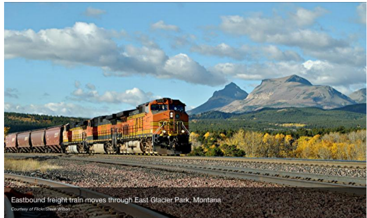
Eastbound freight train moves through East Glacier Park, Montana

The railroads have invested heavily in their tracks, bridges, and tunnels, as well as adding new capacity for freight and passengers. While the freight railroads carry the majority of the responsibility for track upkeep, both freight and passenger railroads have made significant investments using both private and public funding. Intercity and commuter passenger ridership are showing year-over-year growth as a viable commuting option for dense urban areas. Meeting capacity demands will be an ongoing challenge as rail ridership and freight rail continue to gradually increase.