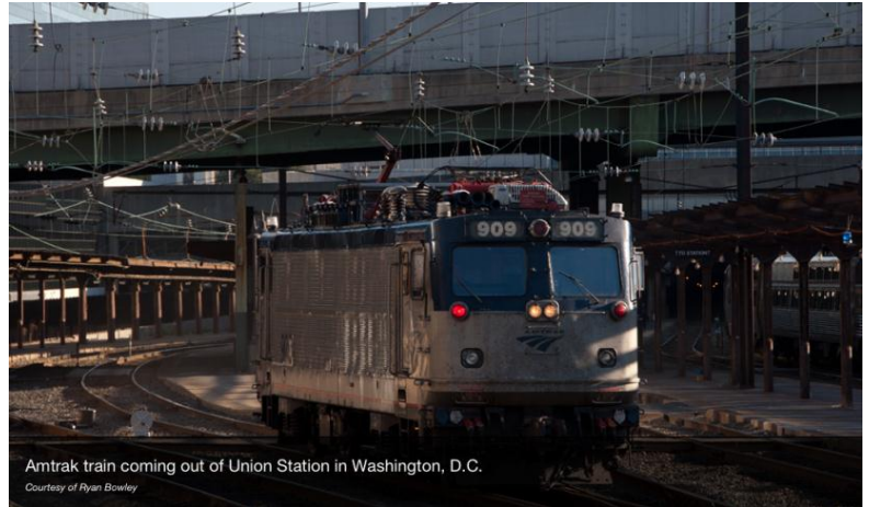
Amtrak train coming out of Union Station in Washington, D.C.

as shedding lines that were underutilized. Regional and short line railroad operators took over many of the rail network's "fingers" that connected customers in rural areas to the main arteries or "highways" of the Class I network. Short line railroads also connect many shippers in rural areas to main Class I and II railroads, which then transport goods over longer distances. However, many regional and short line railroad operators only maintain their segments to the most efficient level of operation, and high fixed costs in addition to new regulations can force operators to discontinue service.