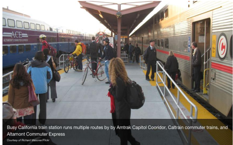
Busy California train station runs multiple routes by Amtrak Capitol Corridor, Caltrain commuter trains, and Altamont Commuter Express