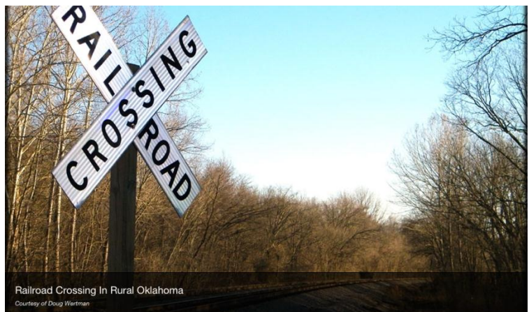
Railroad Crossing In Rural Oklahoma

Although oil has been produced in Oklahoma for decades, only recently did geologists confirm that up to 80 percent of the recoverable reserves may still be in the ground. However, the state-owned 49-mile rail route to take the oil to the refineries between Sayre and Clinton was taking several days because the track was not rated for higher-